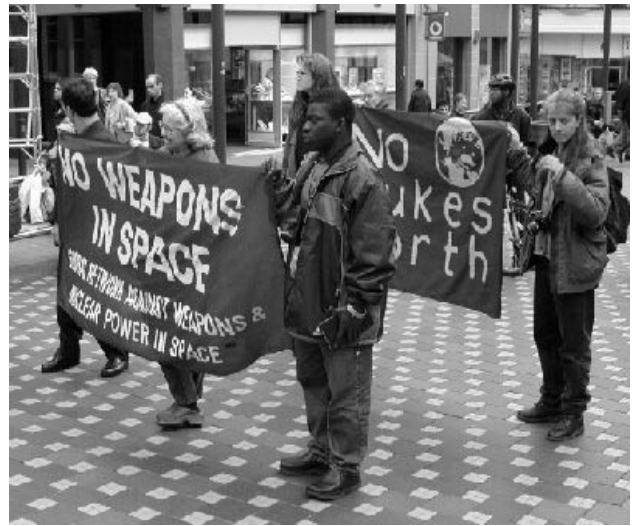
Banners and people in Leeds. May 2001